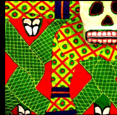
April 16, 2009

discusses a collaborative project to develop the expressive and interpretative capacities of 200 elementary school art students.